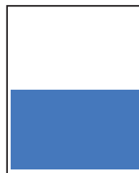
1/2 page 10.75"x7" $200